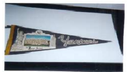
1967 NY Yankees Team Picture Pennant