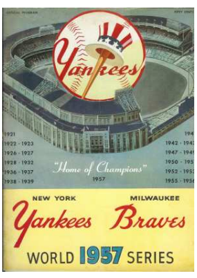
1957 WS Program

WE NOW ACCEPT PAYPAL for all of your purchases. If ordering just send Paypal payment to: <a href="mailto:klassickorner@aol.com">klassickorner@aol.com</a> We also accept: personal checks, money orders and cash. Call (609) 586-4815 if you have any questions or e-mail us at: <a href="mailto:info@classic-corner.com">info@classic-corner.com</a>